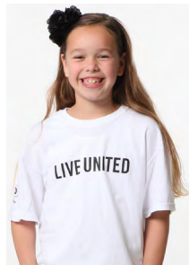
Successful middle-school transitions