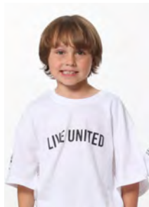
Early Grade Literacy