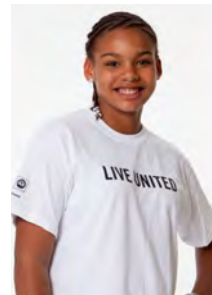
On-time High school graduation